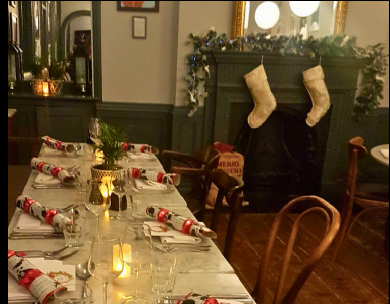
ABBEY HOTEL KITCHEN EST. 1739 70 people seated 90 people standing