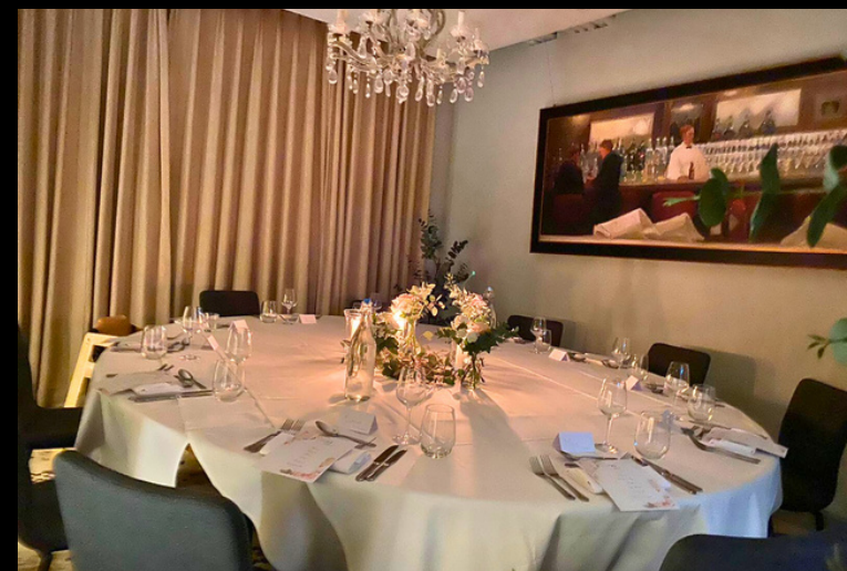
Bolt Hole 15 people seated 30 people standing