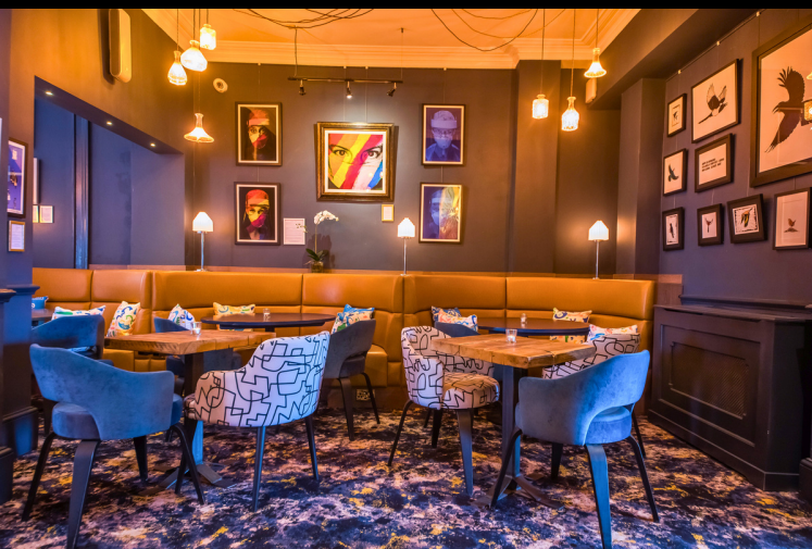
ARTBAR 30 people seated 70 people standing