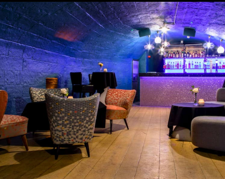
THE escape 45 people seated 90 people standing